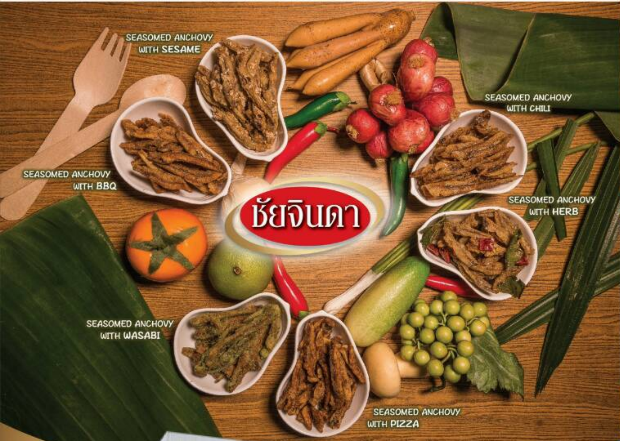
SEASOMED ANCHOVY WITH SESAME